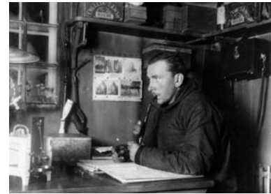
Alfred Wegener, Greenland, 1930