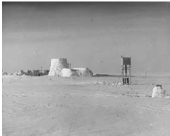
Eismitte Camp, Greenland, 1930-1931

Iceland was settled in 834 AD, established its own parliament in 930 and recorded its first historical volcanic eruption ~934 AD, during which Eldagia, the longest volcanic fissure in the world, was created. Due to the amount of volcanic activity – averaging one every three years – and the resulting devastation to the country of Iceland from lava, ash and sometimes years of famine, there is a well documented record of Icelandic volcanic eruptions. The volcanic materials settle onto the nearby Greenland ice sheet and become incorporated into the ice core record.