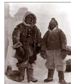
Wegener (left) & Villumsen November 1 st , 1930