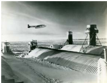
Camp Century, Greenland, late 1950's Mobile Nuclear Power Plant

Drilling into polar ice sheets was first accomplished in 1956, just prior to the International Geophysical Year, at Site 2, northwest Greenland. After two attempts in 1961 and 1962 at Camp Century, a third core site was started in 1963 and re-cored using different drills. In July, 1966 the drill reached the base of the ice sheet. The 1390-meter deep ice core provided evidence of three separate climatic oscillations.