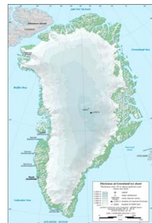
Greenland and Iceland

The Icelandic volcano signature – opposed dual anomalies of high conductivity and low nitrates – provide time markers to use absolute dating techniques for events recorded within the Greenland ice core. The Icelandic eruptions release most of their products into the upper troposphere and deposition usually occurs with a few days to a couple of weeks. Volcanic eruptions at mid to equatorial latitudes must be powerful enough to eject some of their materials up into the stratosphere for global circulation patterns to transport them to the Polar Regions. This results in up to a one-year delay from eruption to deposition on the Greenland ice sheet if the eruption occurred in the southern hemisphere. The dating of volcanic activity with the conductivity record, added with the ability to distinguish general geographical latitudes, provides supporting evidence to date the solar nitrate record.