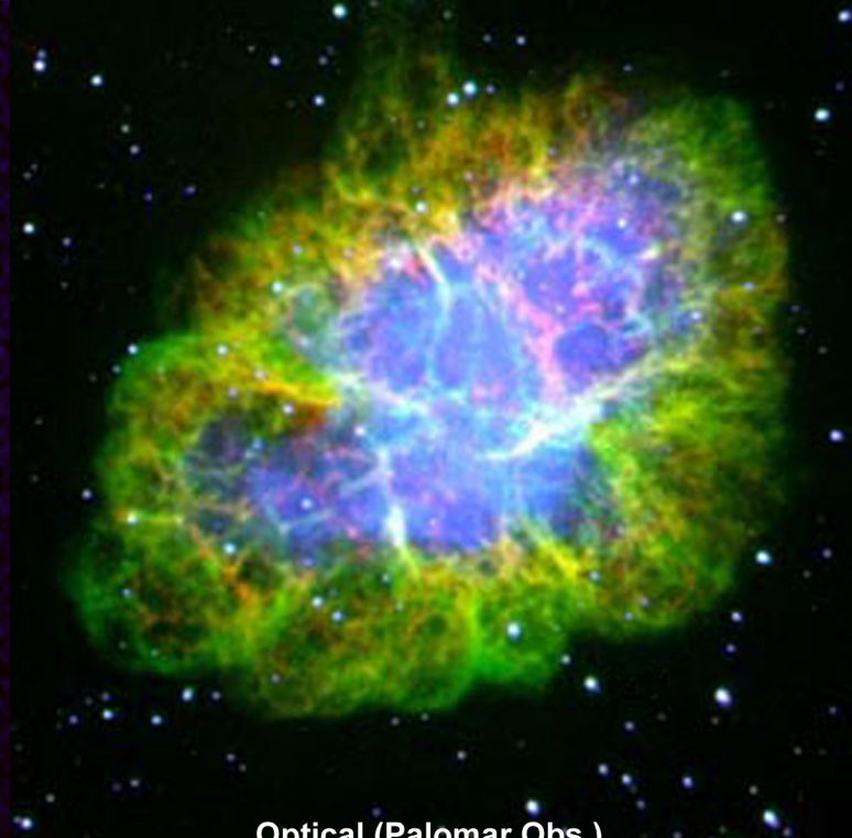
Optical (Palomar Obs.)