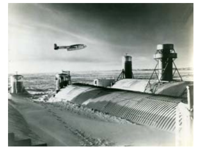
Camp Century, Greenland, late 1950's Mobile Nuclear Power Plant

continental drift and was ridiculed by most prominent scientists of the time as he could not provide evidence of the mechanism that would drive drifting continents. Eventually plate tectonics would prove to be the mechanism, and Iceland – the Land of Fire and Ice right next door to the Greenland ice sheet – is defined by its position astride two diverging plates – providing the mechanism for "drifting continents".