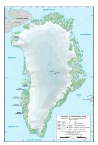
Greenland and Iceland

The Icelandic volcano signature – opposed dual anomalies of high conductivity and low nitrates – provide time markers to use absolute dating techniques for events recorded within the Greenland ice core. The Icelandic eruptions release most of their products into the upper troposphere and deposition usually occurs with a few days to a couple of weeks. Volcanic eruptions at mid to equatorial latitudes must be powerful enough to eject some of their materials up into the stratosphere for global circulation patterns to transport them to the Polar Regions. This results in up to a one-year delay from eruption to deposition on the Greenland ice sheet if the eruption occurred in the southern hemisphere. The dating of volcanic activity with the conductivity record, added with the ability to distinguish general geographical latitudes, provides supporting evidence to date the solar nitrate record.